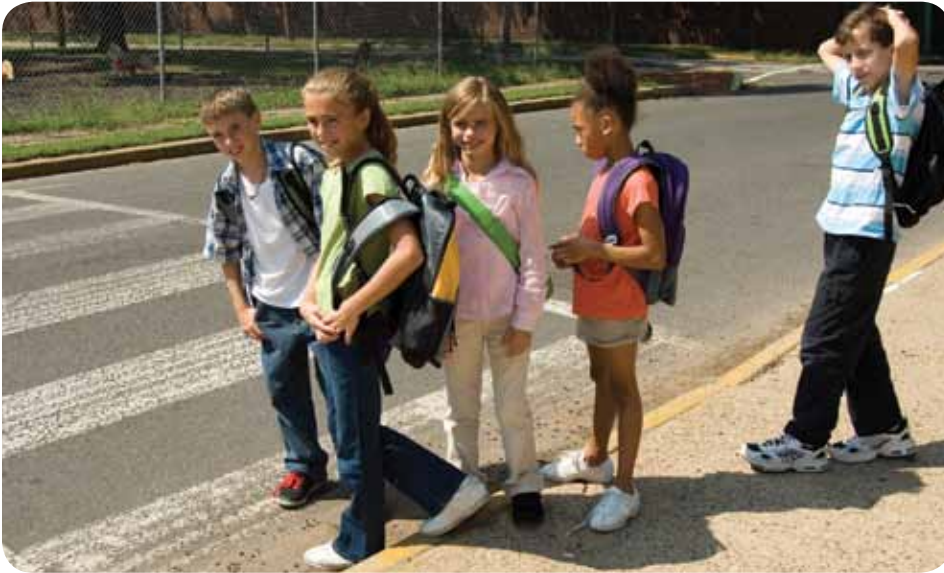
There is public support for using ASE to reduce speeds in Minnesota school zones and work zones.

Prompted by the gap in Minnesota between state policy and the safety benefits and strong support for ASE, researchers at the Humphrey School of Public Affairs designed a study to investigate scenarios for an ASE pilot program in Minnesota.