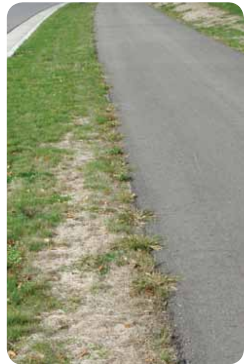
Typical roadside damage to turfgrass can be caused by salt, heat, and drought.