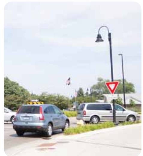
Researchers studied this roundabout in Richfield, Minnesota.

A research brief summarizing MTO roundabout research— Safety and Risk in Modern Urban Roundabouts —is on the CTS website.