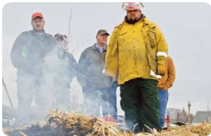
Prescribed burning was one of the topics at the Demo Day.