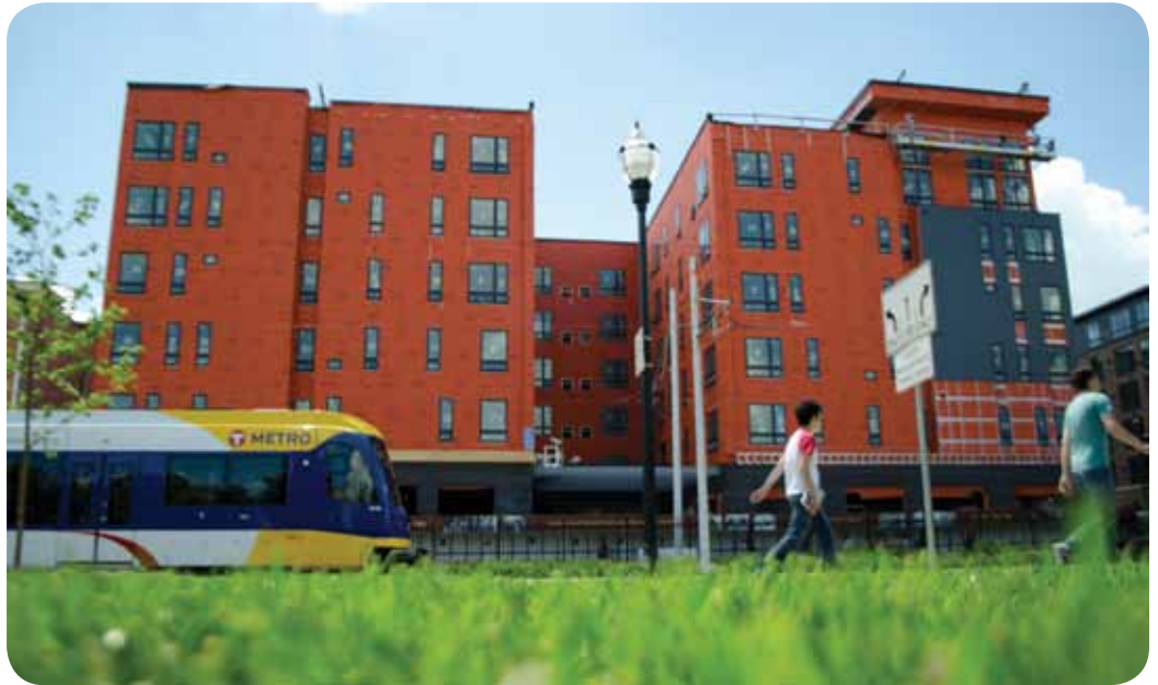
A new housing development along the Green Line

The research was based on building permit data from the City of St. Paul and tax parcel data from Ramsey County.