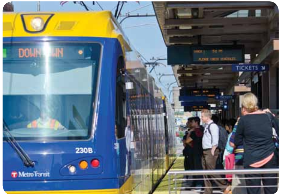
The Green Line is here.

will increase need for RESILIENT TRANSPORTATION SYSTEMS. page 3